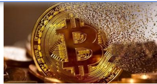
Komisija odobrila izdavanje prvog digitalnog tokena u Srbiji