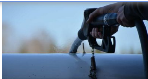
Cene sirove nafte na istorijskom rekordu