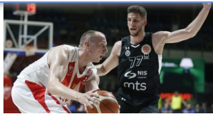
Bivši plej Partizana nakon haosa na derbij: Vidimo se u sredu