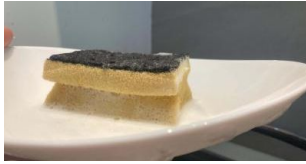
Henkel Serbia received 4.5 million euros in subsidies for production in Krusevac